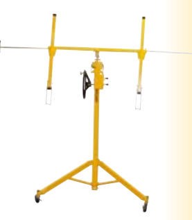
Panel-Jax Drywall Lift Model DL 150, 5'-15'