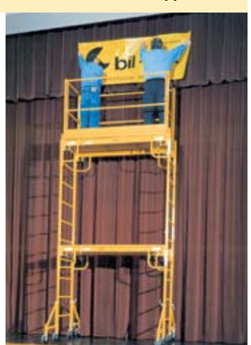
Units can be stacked for additional working height.

Due to continuous product improvements, we reserve the right to make specification and/or equipment modifications without prior notification or obligation. All photographs and drawings in this brochure are for illustrative purposes only. Refer to applicable ANSI and OSHA Codes and Regulations for the proper use of this equipment and do not use in areas where user and/or equipment can come in contact with live power. Failure to follow the appropriate safety instructions and procedures, or to otherwise act irresponsibly, may result in serious injury or death.