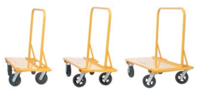
Drywall Cart DC 3000 LD

The Drywall Cart is designed to haul full capacity loads with easy maneuverability and complete stability. Support bracing is removable for easy storage and handling.