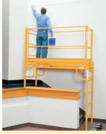
Pro-Jax units (with casters removed) can be used on stairs.