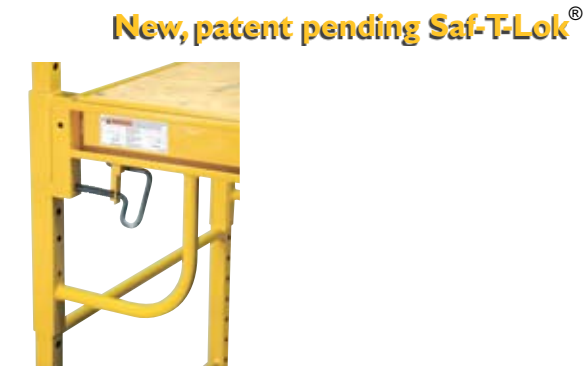
Unique Saf-T-Lok® provides added safety and is more effecient for use.