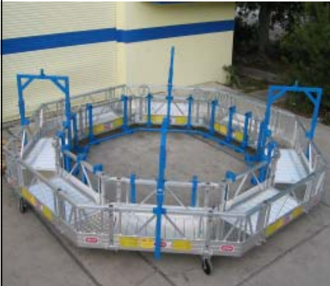
The platform should now look like the above picture.