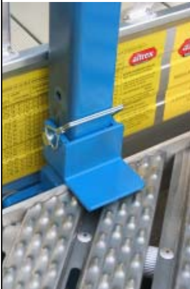
14. Install the locking brackets to prevent the custom decks from lifting up while suspended.