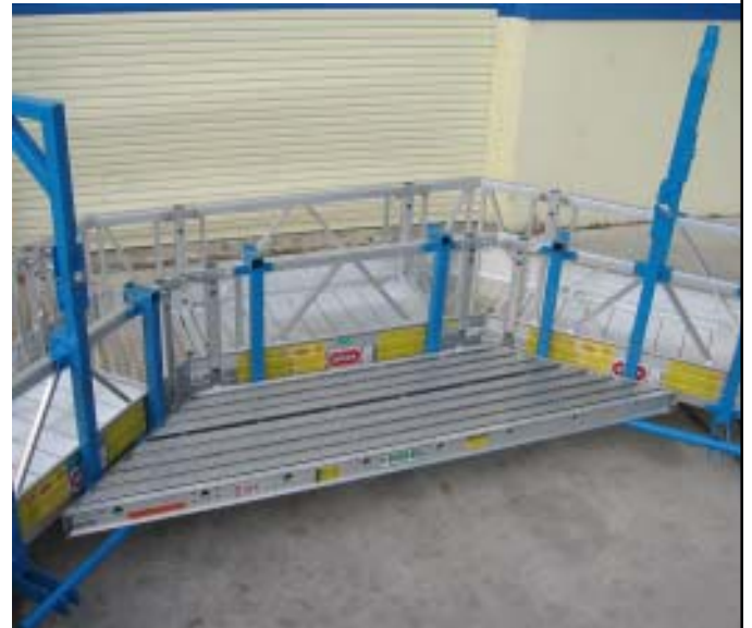
13. Place the custom decks onto the dancefloor supported tubing.